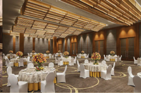
Venue: Hyatt Regency, Ahmedabad